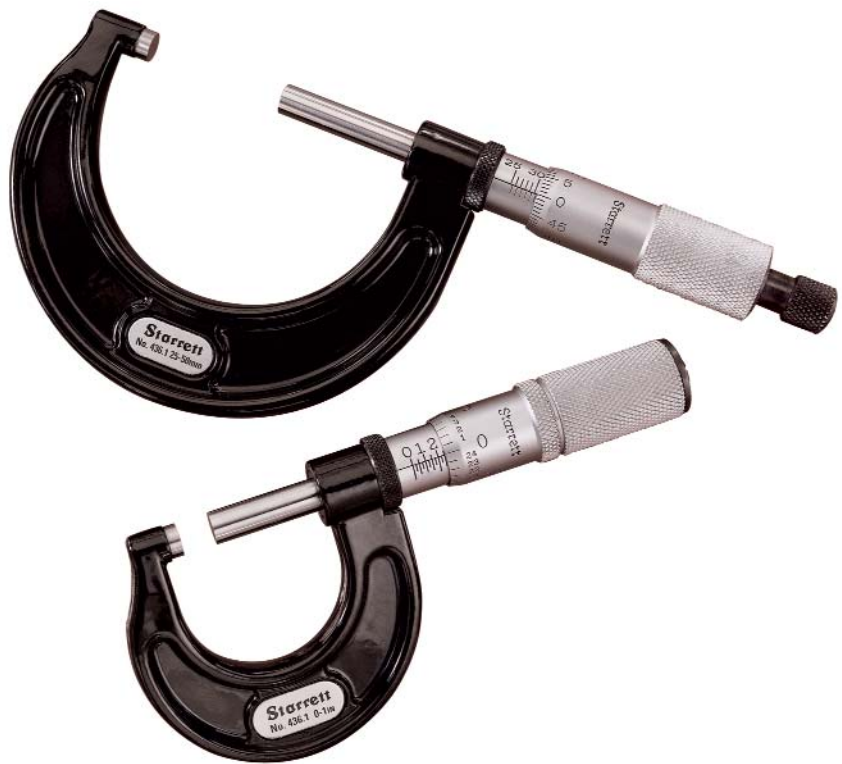
Shown above, top, No. 436.1MRL-50 millimeter model; bottom, inch model No. 436.1FL-1.